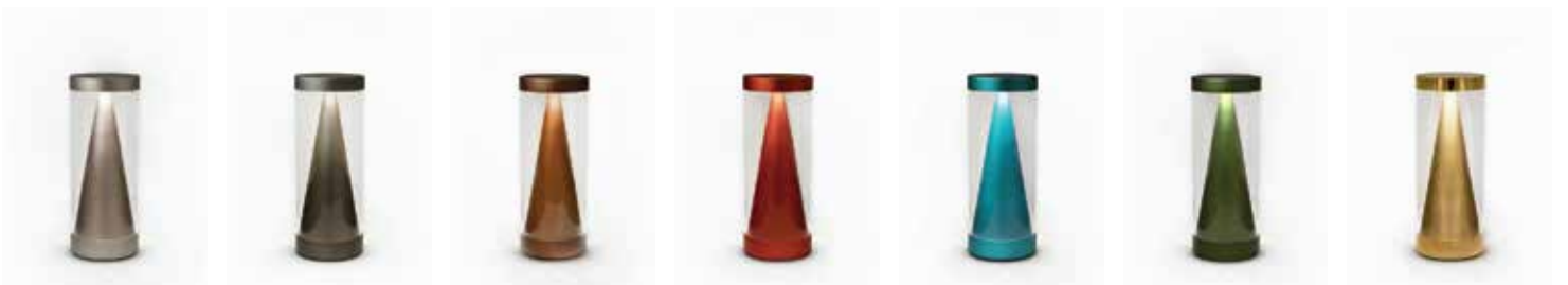
Anodised Silver Aluminium