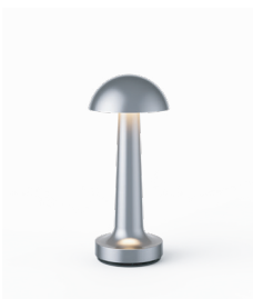
Anodised Silver Aluminium