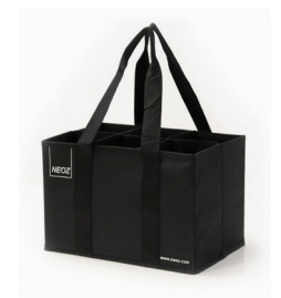
Handling Accessory 6 Lamp Carrier (Optional)