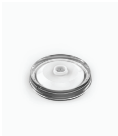
Single Lamp Charger 1 Lamp