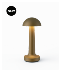
Anodised Sandblasted Bronze Aluminium