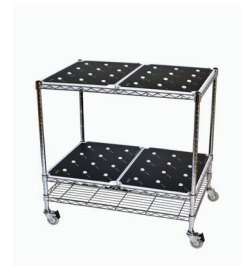
Large Recharging Station 48 Lamps