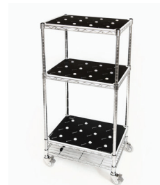
Medium Recharging Station 36 Lamps