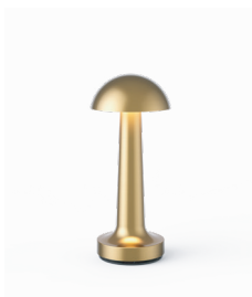
Lacquered Real Brass