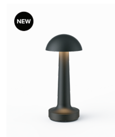
Anodised Sandblasted Black Aluminium