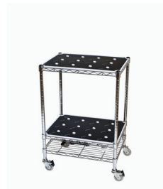
Small Recharging Station 24 Lamps