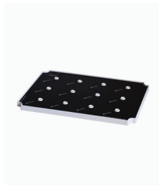
Large Recharging Tray 12 Lamps