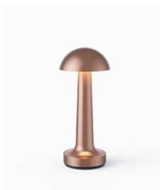
Lacquered Real Copper