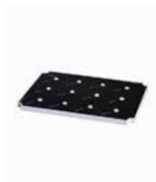
Large Recharging Tray 12 Lamps