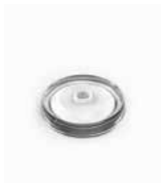
Single Lamp Charger 1 Lamp