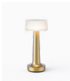
Lacquered Real Brass