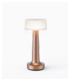
Lacquered Real Copper