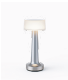
Anodised Silver Aluminium