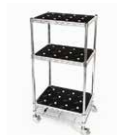
Medium Recharging Station 36 Lamps