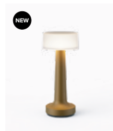
Anodised Sandblasted Bronze Aluminium