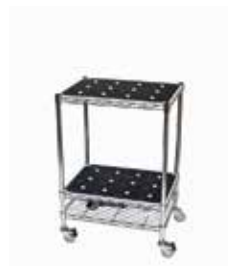
Small Recharging Station 24 Lamps