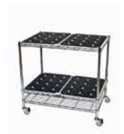
Large Recharging Station 48 Lamps