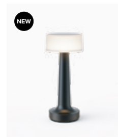
Anodised Sandblasted Black Aluminium