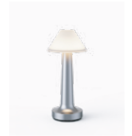
Anodised Silver Aluminium