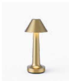
Lacquered Real Brass