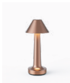
Lacquered Real Copper