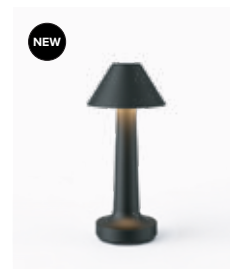
NEW Anodised Sandblasted Black Aluminium