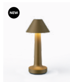
NEW Anodised Sandblasted Bronze Aluminium