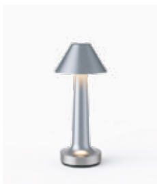
Anodised Silver Aluminium