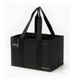
Handling Accessory 6 Lamp Carrier (Optional)