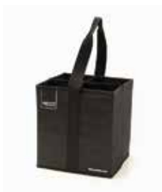
Handling Accessory 4 Lamp Carrier (Optional)