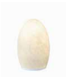
Hand Blown Glass Opal