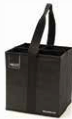
Handling Accessory 4 Lamp Carrier (Optional)