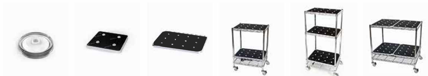
Single Lamp Charger 1 Lamp