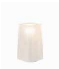
Sand Blasted Pressed Glass Ice Round 85