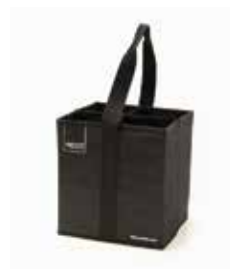
Handling Accessory 4 Lamp Carrier (Optional)