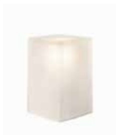
Sand Blasted Pressed Glass Ice Round 100