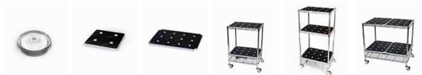
Single Lamp Charger 1 Lamp Small Recharging Tray 4 Lamps Large Recharging Tray 12 Lamps Small Recharging Station 24 Lamps Medium Recharging Station 36 Lamps Large Recharging Station 48 Lamps