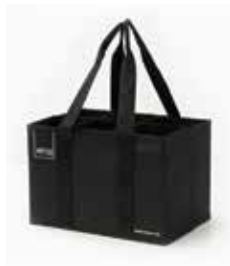
Handling Accessory 6 Lamp Carrier (Optional)