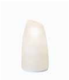
Sand Blasted Hand Blown Glass